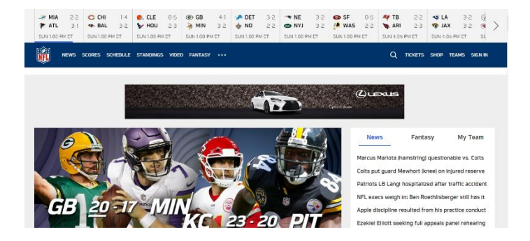
NFL: Right Navigation