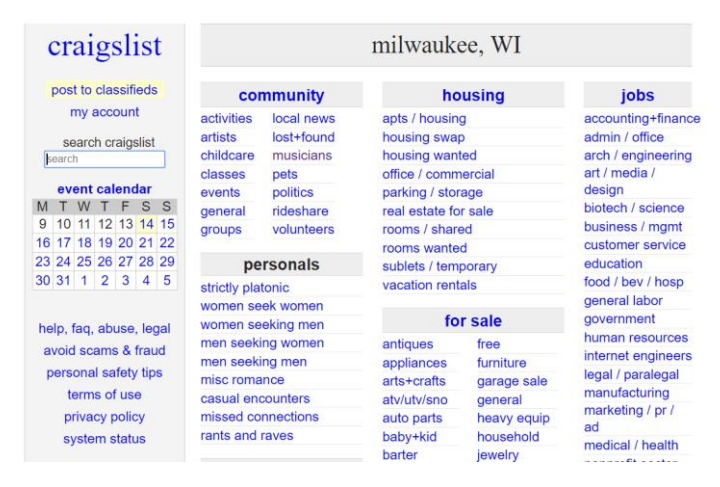
Craigslist: 4-column design