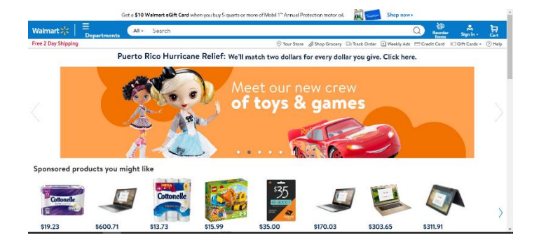
Walmart: Multi-Column with Scrolling Product Bands